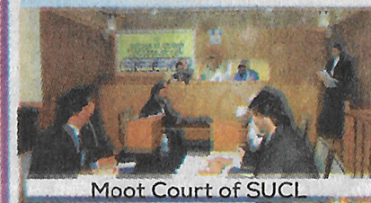
Moot Court of SUCL