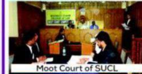
Moot Court of SUCL