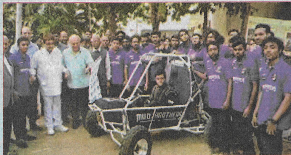
MJCET Students with the All Terrain Vehicle (ATV) designed by them for national Championship